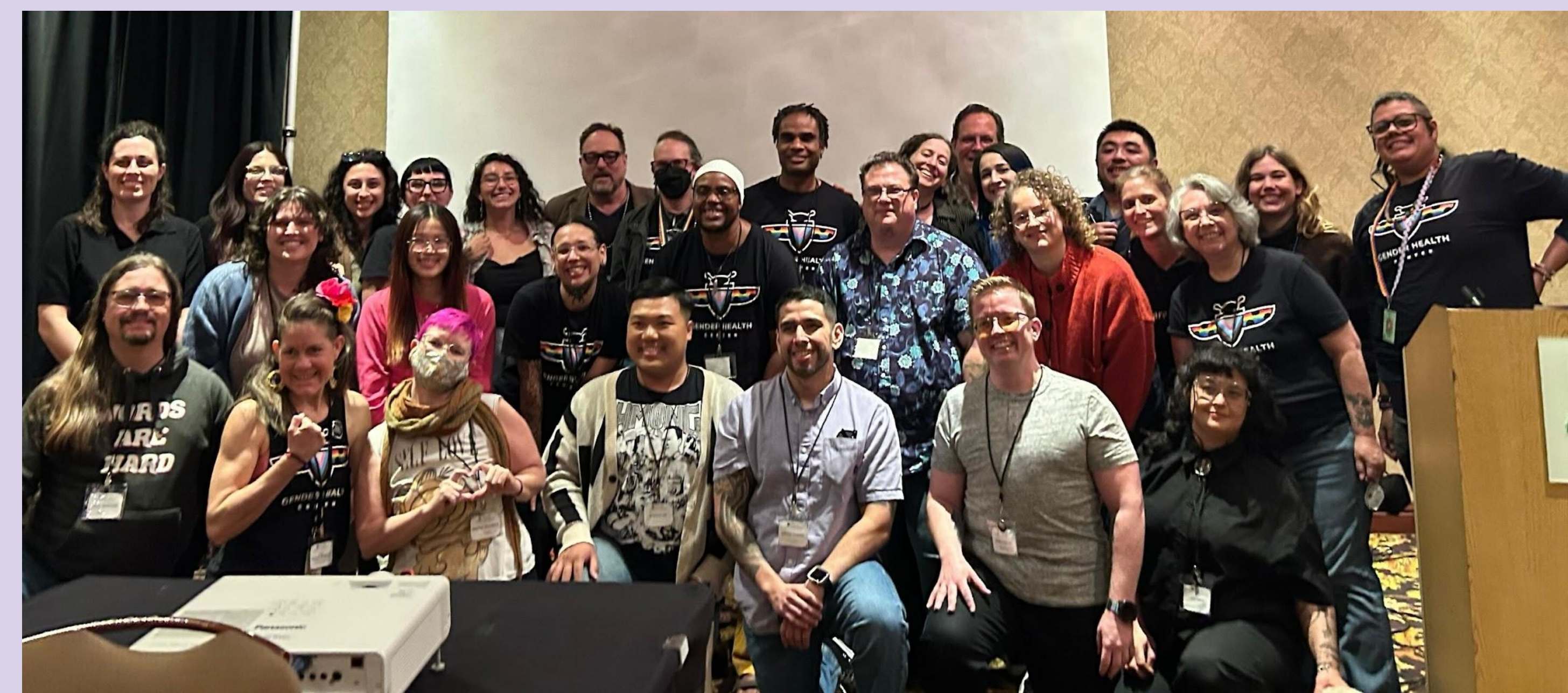
Gender Health Center alumni, current students, and clinical supervisors, varying from 2015-2025, united at the International Narrative Therapy Conference in Sacramento, CA in October 2025.